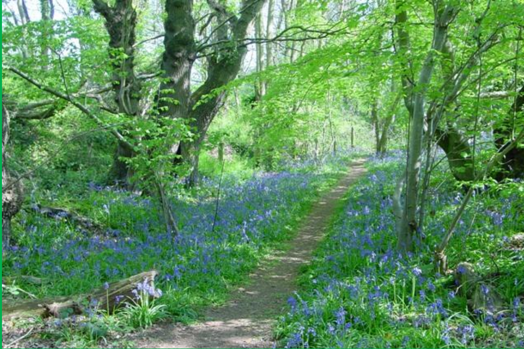
Bluebell Walk - May 2010

owned and managed by the North Norfolk Community Woodland Trust.